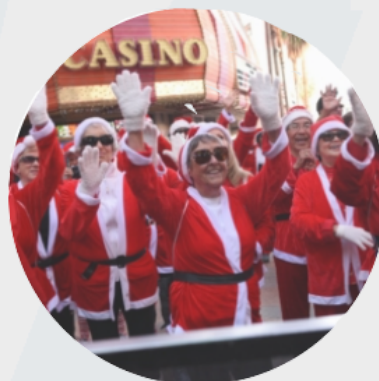
Las Vegas Great Santa Run