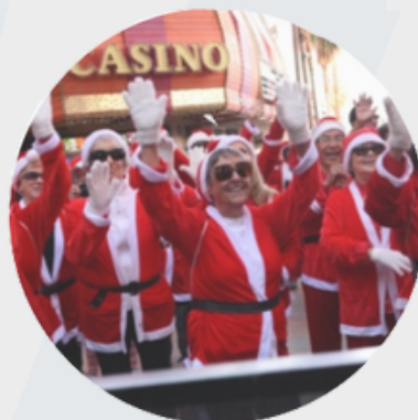
Las Vegas Great Santa Run